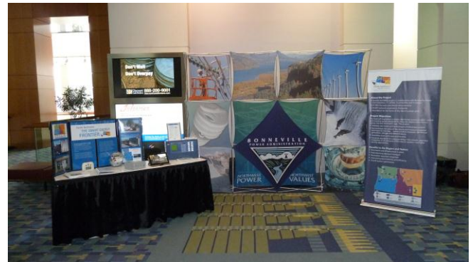
BPA's booth at GridWeek, Oct. 2 – 4 in Washington, D.C.

Washington, D.C. Oct. 2 – 4. This opportunity provided an excellent venue for PNWSGDP information sharing, including featured speaking, a special media event and panel discussions from BPA, Battelle, technology vendors and utility partners. BPA also staffed booth that was packed with visuals including banners, a phasor measurement unit, smart meter, home energy management devices and numerous fact sheets.